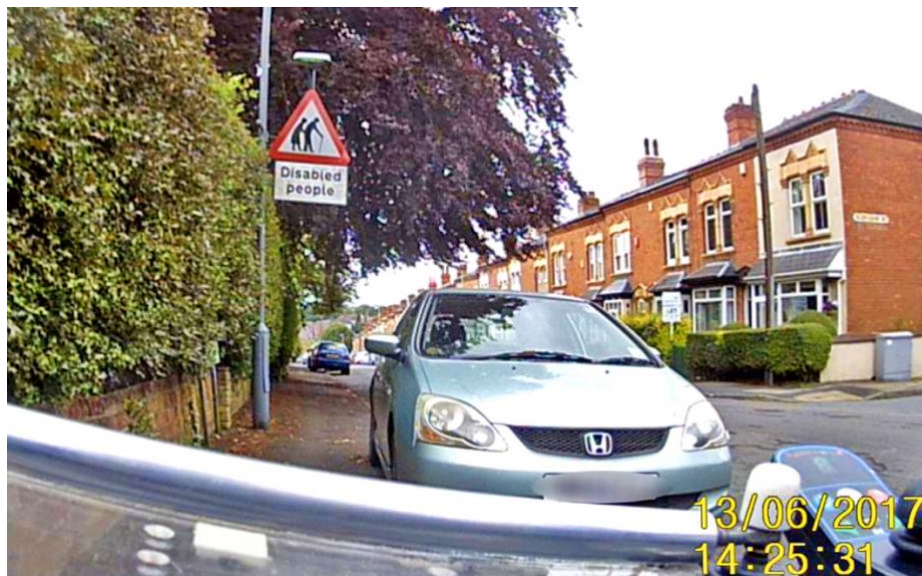
Figure 2. Isobel's footage shows the 'Disabled People' road sign with cars still parking on the pavement.

The participants were angry that the parking of cars on the pavement reflected a wilful disregard for the needs of those in wheelchairs. This was evidenced by the fact that cars continued to park on the pavements close to the centre, despite a number of signs on the road outside CPM to 'alert' drivers that disabled people use the pavement (Figure 2).