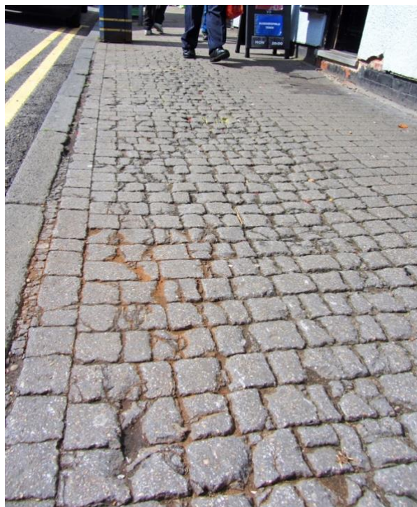
Figure 4. An uneven and broken section of the pavement on Harborne High Street.

Whilst uncomfortable for all participants, the uneven surfaces appeared to pose a danger particularly for participants who manually propelled and manoeuvred their own wheelchairs.