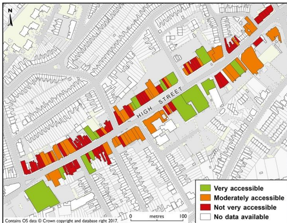
Figure 8. Colour-coded map of accessibility of the businesses on Harborne High Street.

Imrie's (2001) notion of urban apartheid is reinforced by the results of our business accessibility survey in Harborne. Of the 110 businesses surveyed, only 13% might be considered 'very accessible', 33% 'moderately accessible' and 54% 'not very accessible' (Figure 8), although we note that Harborne High Street appears to be less accessible than is the norm in the UK. DisabledGo, an organisation that provides accessibility information for disabled people, found in a study of over 30,000 shops and restaurants on British high streets that 20% were not able to provide step-free access (see DWP, 2014).