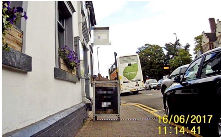
Figure 3. Footage from Ralph's GoPro showing the placing of a sandwich board that has created a narrow passage on the pavement.