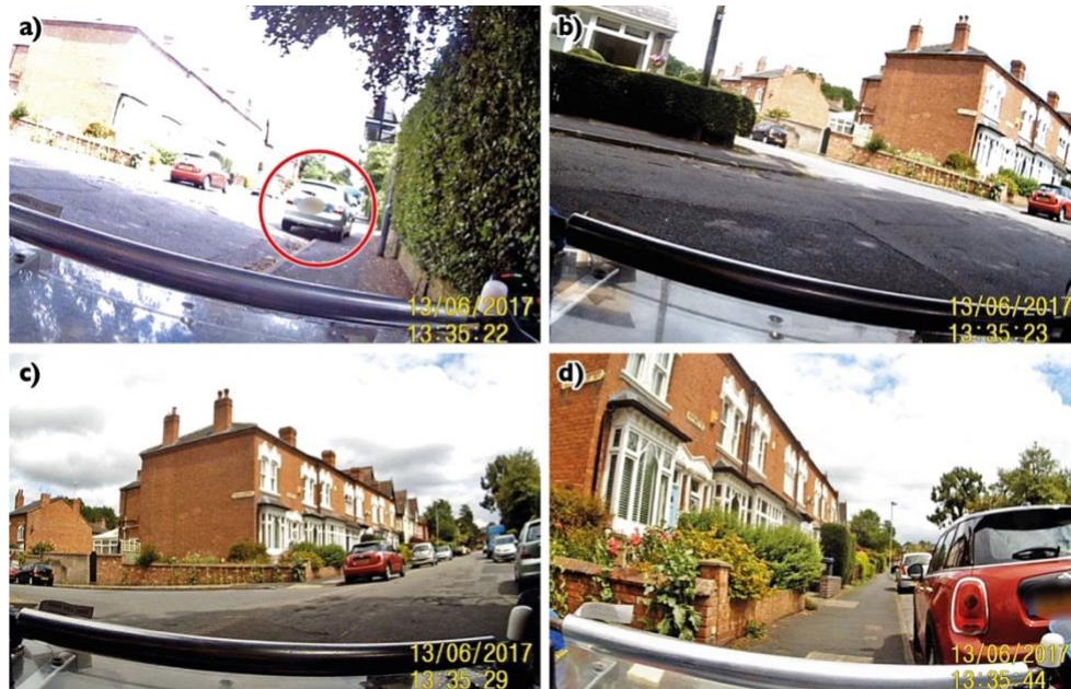
Figure 1. Sequence of events during which Isobel was forced to cross the road to circumnavigate a car that was blocking the pavement: a) Isobel notices the car parked on the pavement ahead (circled); b) she turns to cross the road as the gap is too narrow to pass through; c) crossing the road; d) using the pavement on the other side of the road, which is clearer.

The participants were angry that the parking of cars on the pavement reflected a wilful disregard for the needs of those in wheelchairs. This was evidenced by the fact that cars continued to park on the pavements close to the centre, despite a number of signs on the road outside CPM to 'alert' drivers that disabled people use the pavement (Figure 2).