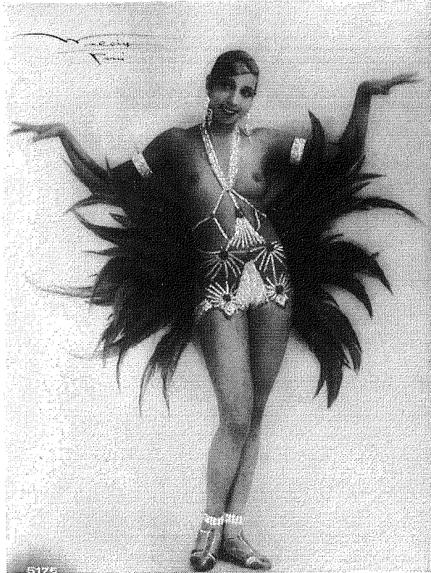
Fig. 9-2: Josephine Baker in more erotic attire

Frida Kahlo developed her artistic style in, and despite, Mexico's strictly domestic paradigm for women. Like Baker, she utilized different strategies to transgress the limiting measures imposed on her by the patriarchal society. She was a product of mixing races and ethnicities—Jewish, Hungarian, Spanish, and Indian—standing at the cultural crossroads and always seeking roots. Living within conflict, Kahlo combined in her work contrasting ideas—modern and pre-Columbian, religious and national, male and female, Indian and European, art and craft, high and