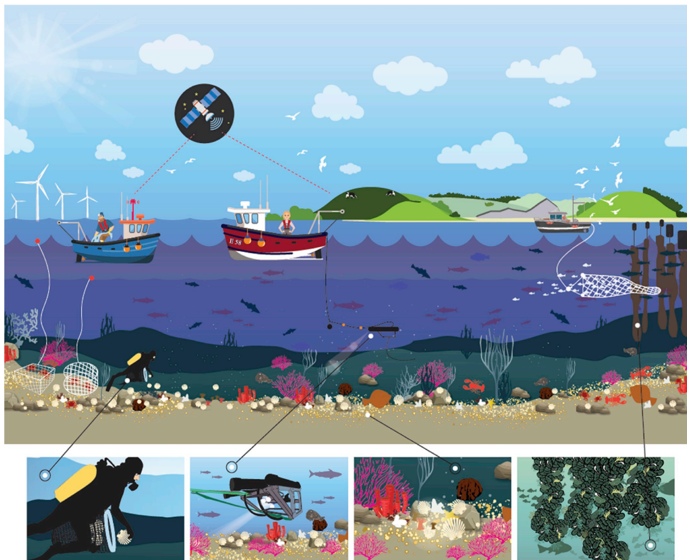
Fig. 1. Ambitious marine conservation 1) Reflects an ambition for sustainable livelihoods by fully integrating fisheries management with conservation (Ecosystem Based Fisheries Management) as the two are critically interdependent; 2) Establishes a world class and cost effective ecological and socio-economic monitoring and evaluation framework that includes the use of controls and Sentinel Sites to improve sustainability in marine management; 3) Requires a shift from managing individual marine features within MPAs to whole-sites to enable repair and renewal of marine systems; and 4) Challenges policy makers and practitioners to integrate MPAs into the wider seascape as critical functional components rather than a competing interest and move beyond MPAs as the only tool to underpin the benefits derived from marine ecosystems by identifying other effective area-based conservation measures (OECMs) to establish synergies with wider governance frameworks.

Within the EU Marine Strategy Framework Directive (Directive 2008/56/EC) sea-floor integrity is a descriptor used to assess Good Environmental Status [47]. Good Environmental Status is considered to be met when, ‘sea-floor integrity is at a level that ensures that the structure and functions of the ecosystems are safeguarded and benthic ecosystems, in particular, are not adversely affected’ [48].