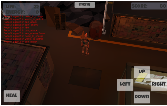
Figure 3: The STEALTHIERPOSH Android game illustrating the usage of the logging mechanism on the upper left side of the screenshot. The output contains 10 lines which update every seconds by adding new content ad the top and fading out old information at the bottom.

, both augment a method and attach a name reference allowing the planner to search for them by the name and a version number. In Figure 2 an example action from the STEALTHIER POSH Android game, see Figure 3, is given which is using POSH-SHARP. The primitive is called by the planner when the robot agent needs to recharge the battery and uses a NavMesh[18] to identify if the agent is spatially close to a charger. To follow AB-ED, primitives should be as independent as possible and use their perception to reduce interdependencies. In this case, checking the internal state of the NavMesh. By offering the planner to inspect and search for possible primitives instead of providing them as a list when coding a behaviour library, a potential risk of mistakes is removed from the development process. The usage of the extra name tag allows the usage of names which would otherwise break the naming convention of C# and allows for more descriptive and customised names.