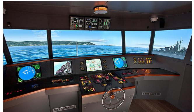
Figure 4: UoP ship simulator, main bridge

pertains to national security, and the equipment necessary to represent shipping environments is much more expensive than more traditional security labs, it may be overlooked as a research field. Providing a space where government industry and academia can pool resources and research efforts will be of significant benefit to all those involved with maritime. While this maritime-cyber lab aims to provide next generation research capabilities, it is not intended as a stand-alone solution. As seen in Figure 1, the Cyber-SHIP lab is meant to be integrated with other existing facilities. In this case, the lab is able to connect to other UoP facilities, including its cyber-range and ship's bridge simulator (Figures 3 and 4 respectively).