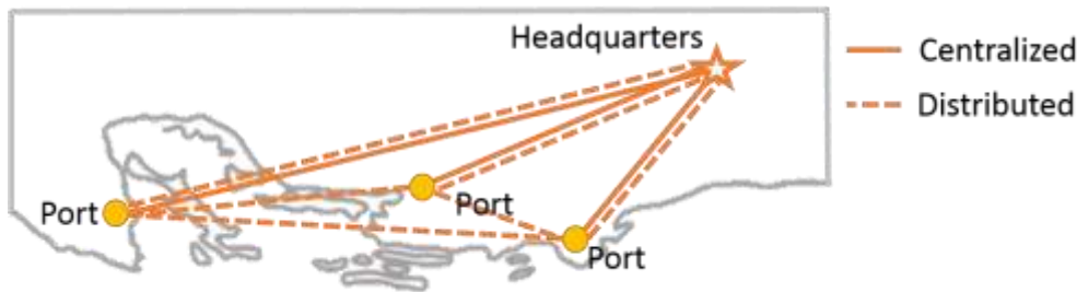
Figure 2 Example of centralized data versus distributed ledges using blockchain technology

Notable efforts by IBM and Maersk are attempting to use global supply blockchains on 10 milling shipping containers [11]. An example of centralized and distributed networks can be seen in Figure 2. As can be seen, the main difference in this simplified example is that the ports are more involved in the data distribution of cargo transactions, storing the ledger, and communications with all parties. While more complex, the actual transactions are also more secure and there is less reliance on a central location to protect a ledger on its own. While blockchain-enabled secure ledgers for the supply chain is an emerging technology to aid the transport of goods, “digital twin” technology is emerging to aid ship design, construction, and track ship performance across its life cycle. Similar to the IBM and Maersk project driving blockchain in shipping logistics, DNV GL, Rolls-Royce and several other groups are driving digital twin projects for ships.