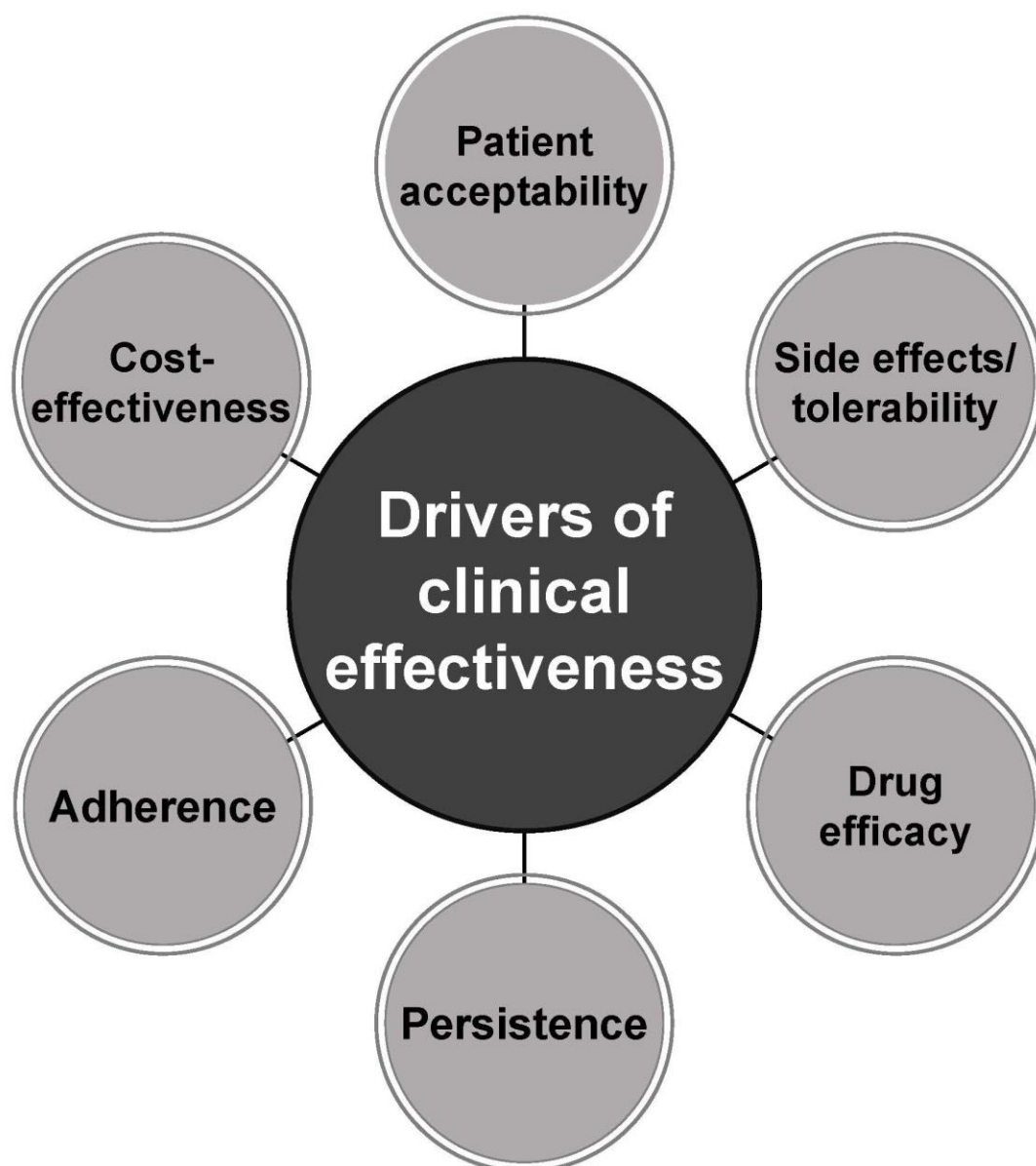
500 Figure 2 Main drivers of clinical effectiveness.