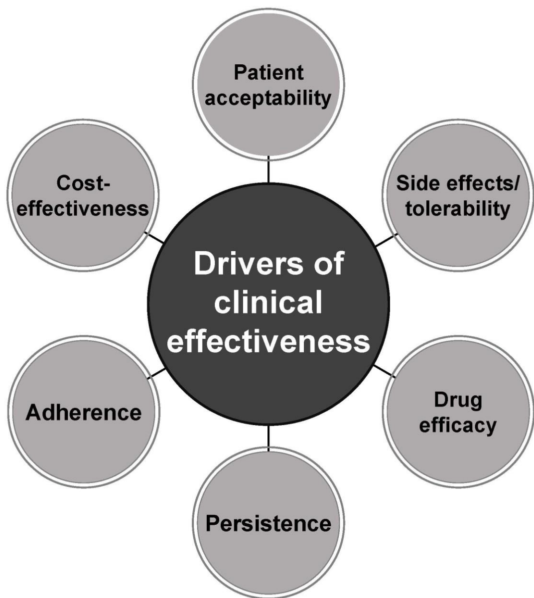
500 Figure 2 Main drivers of clinical effectiveness.