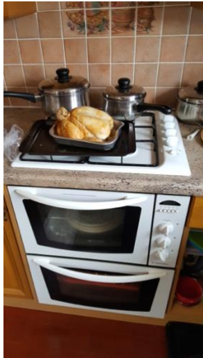
Image 2: "Cooking, I think because it is (old) tradition that the woman does the cooking at home" (Julie)