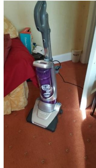
Image 3: "Vacuum cleaner; again, I guess the old image of the woman doing the housework" (Julie)