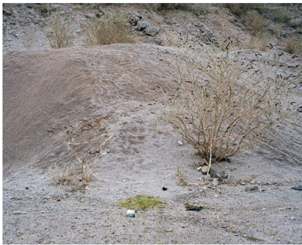
Sandford Quarry Cave