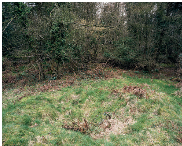
Summit Plantation Mine