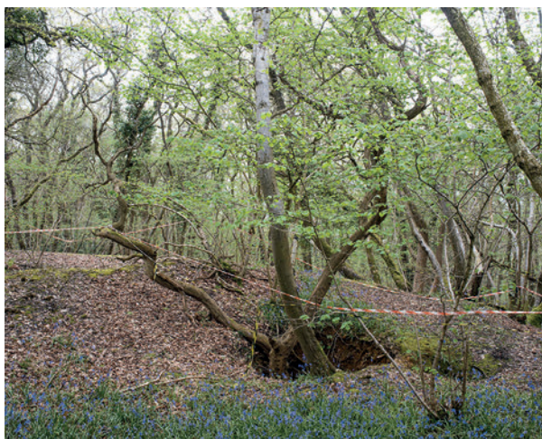
Saville Row Shaft No.1