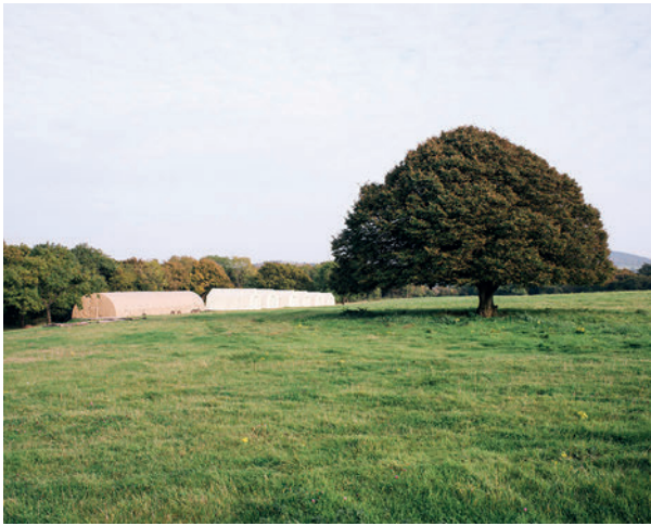
Sandford Hill Mine No.2