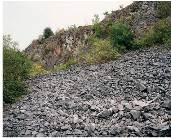
Sandford Hill Mine No.4