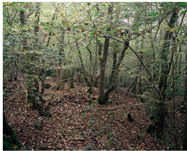
Saville Row Shaft No.3