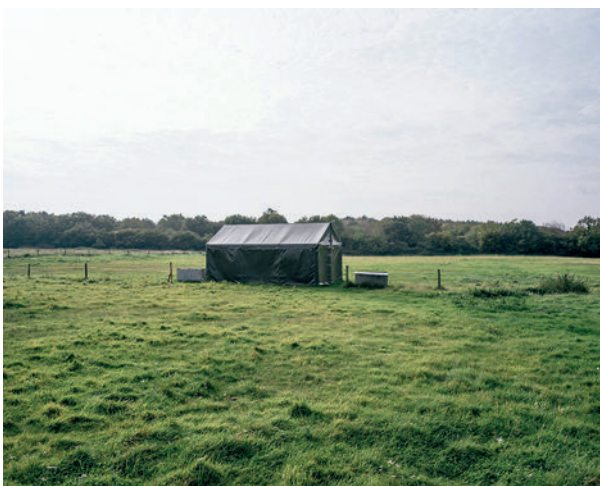
Sandford Rifts East