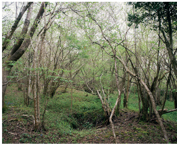
Little Wood Mine