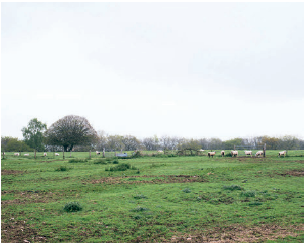
Deep Groove Mine