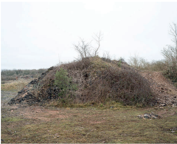
Sandford Ochre Cave