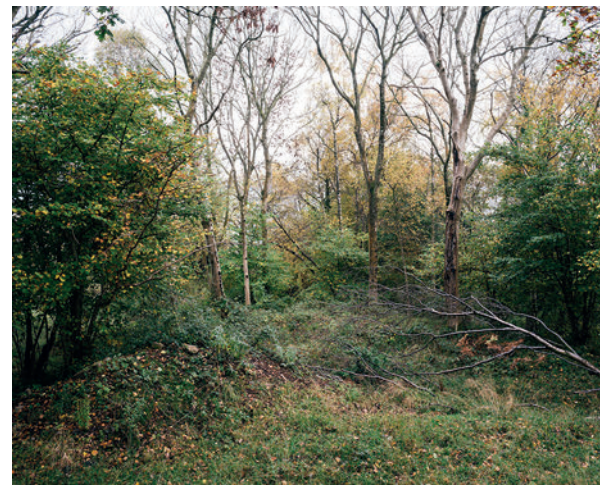
Sandford East Ochre Mine