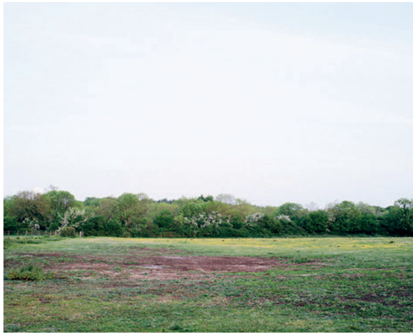
Sandford Hill Mine No.3