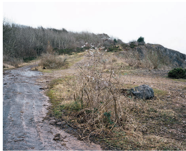
Sandford Quarry Mine