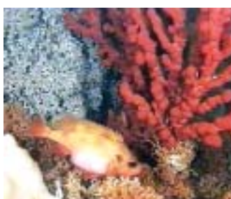
Redfish is a species sought by trawlers.