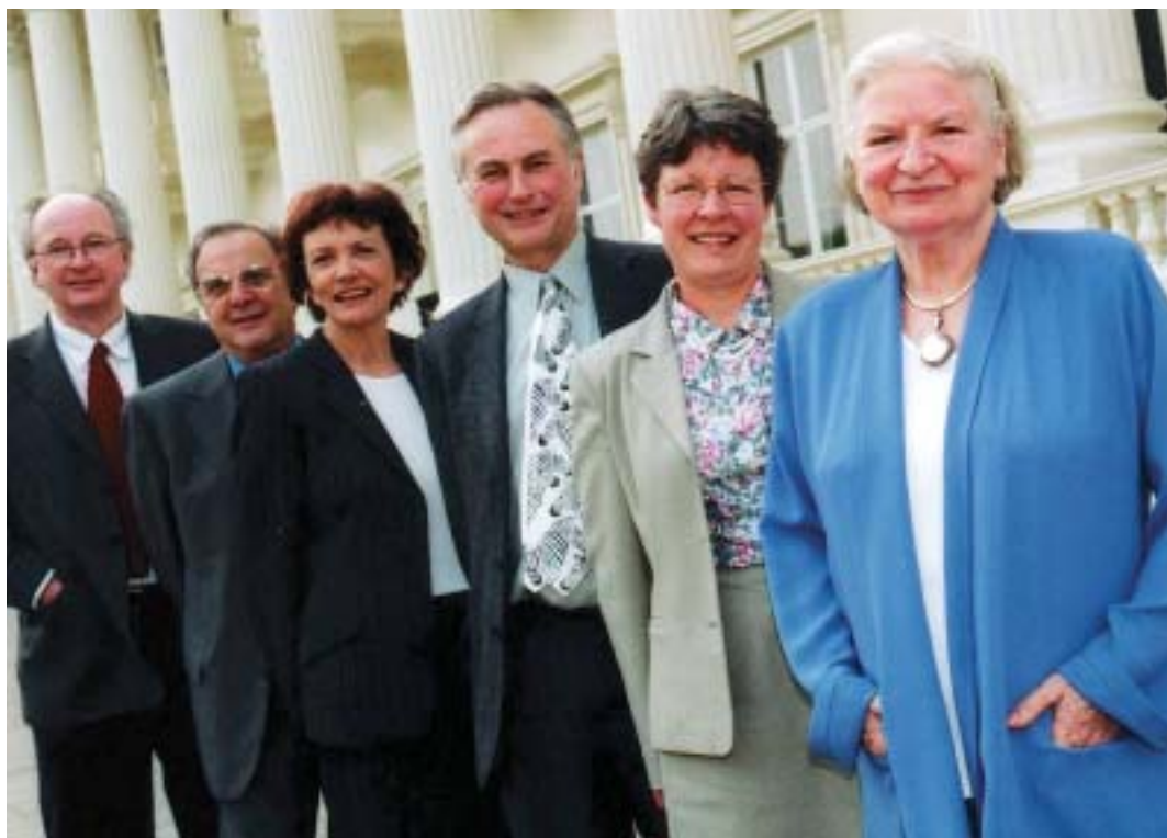
Is science more sympathetic to religion than literature? This was the topic of a panel discussion on 8 May hosted by the Society and the Royal Society of Literature (RSL). Pictured from left to right: Philip Pullman; RSL Chairman Ronald Harwood; broadcaster Joan Bakewell; Professor Richard Dawkins; Professor Jocelyn Bell Burnell and Baroness James of Holland Park. Joan Bakewell's insights on the event can be read on p8.