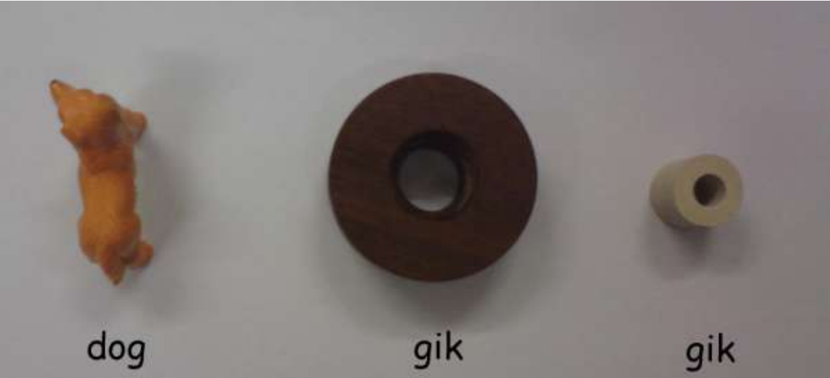
Figure 4: Practice trial 2 objects, as viewed from the experimenters perspective.