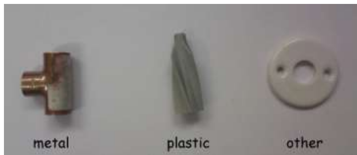
Figure 5: Triad 1 of objects, as viewed from the experimenters perspective, including description of the object that was metal, plastic and other material.