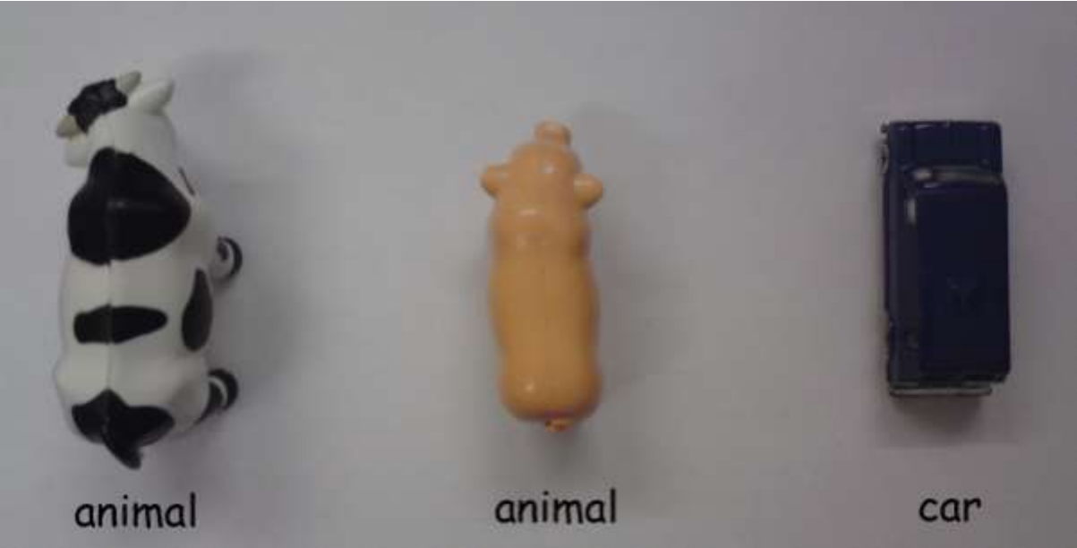
Figure 3: Practice trial 1 objects, as viewed from the experimenters perspective.