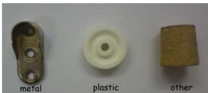
Figure 8: Triad 4 of objects, as viewed from the experimenters perspective, including description of the object that was metal, plastic and other material.