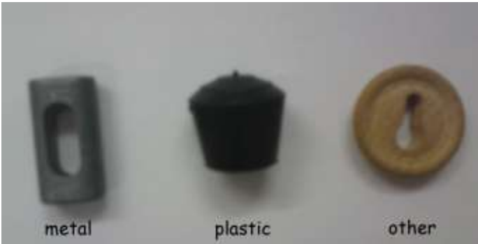
Figure 9: Triad 5 of objects, as viewed from the experimenters perspective, including description of the object that was metal, plastic and other material.