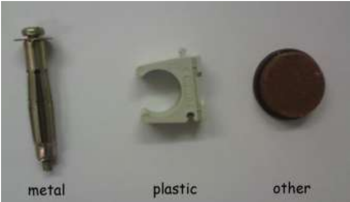
Figure 10: Triad 6 of objects, as viewed from the experimenters perspective, including description of the object that was metal, plastic and other material.