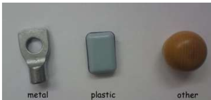
Figure 6: Triad 2 of objects, as viewed from the experimenters perspective, including description of the object that was metal, plastic and other material.