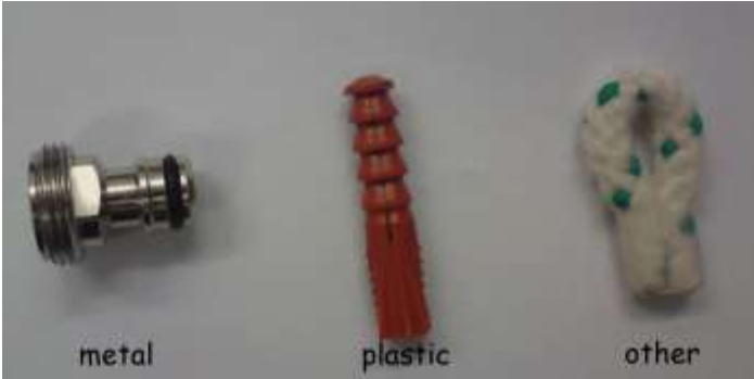
Figure 12: Triad 8 of objects, as viewed from the experimenters perspective, including description of the object that was metal, plastic and other material.