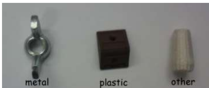
Figure 7: Triad 3 of objects, as viewed from the experimenters perspective, including description of the object that was metal, plastic and other material.