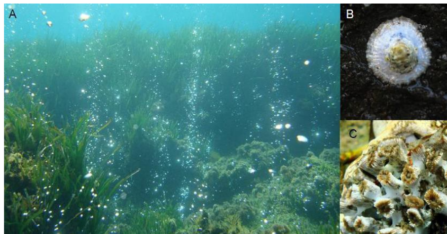
Fig. 2 A) General view of Posidonia oceanica meadow with CO 2 vents at 2 m depth, May 2009. B) Patella caerulea living naturally at mean pH 7.4 showing shell dissolution. C) Cladocora caespitosa transplanted to mean pH 7.4 showing skeletal dissolution.

One of the most obvious effects of the CO 2 vent system is the dissolution of shelled organisms and their absence from waters with a mean pH <7.1 (Figure 2).