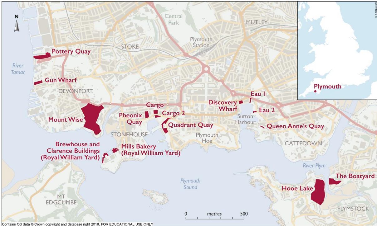
Figure 1. Location of Plymouth waterfront regeneration sites. The fifteen Plymouth developments are spread across the neighbourhoods of Devonport, Millbay and Stonehouse, Sutton Harbour and Plymstock.