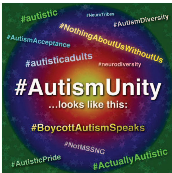
FIGURE 1. Autism diversity poster.

Additionally, we organized a mini public (meeting) in early 2017 to elicit general views on the development of