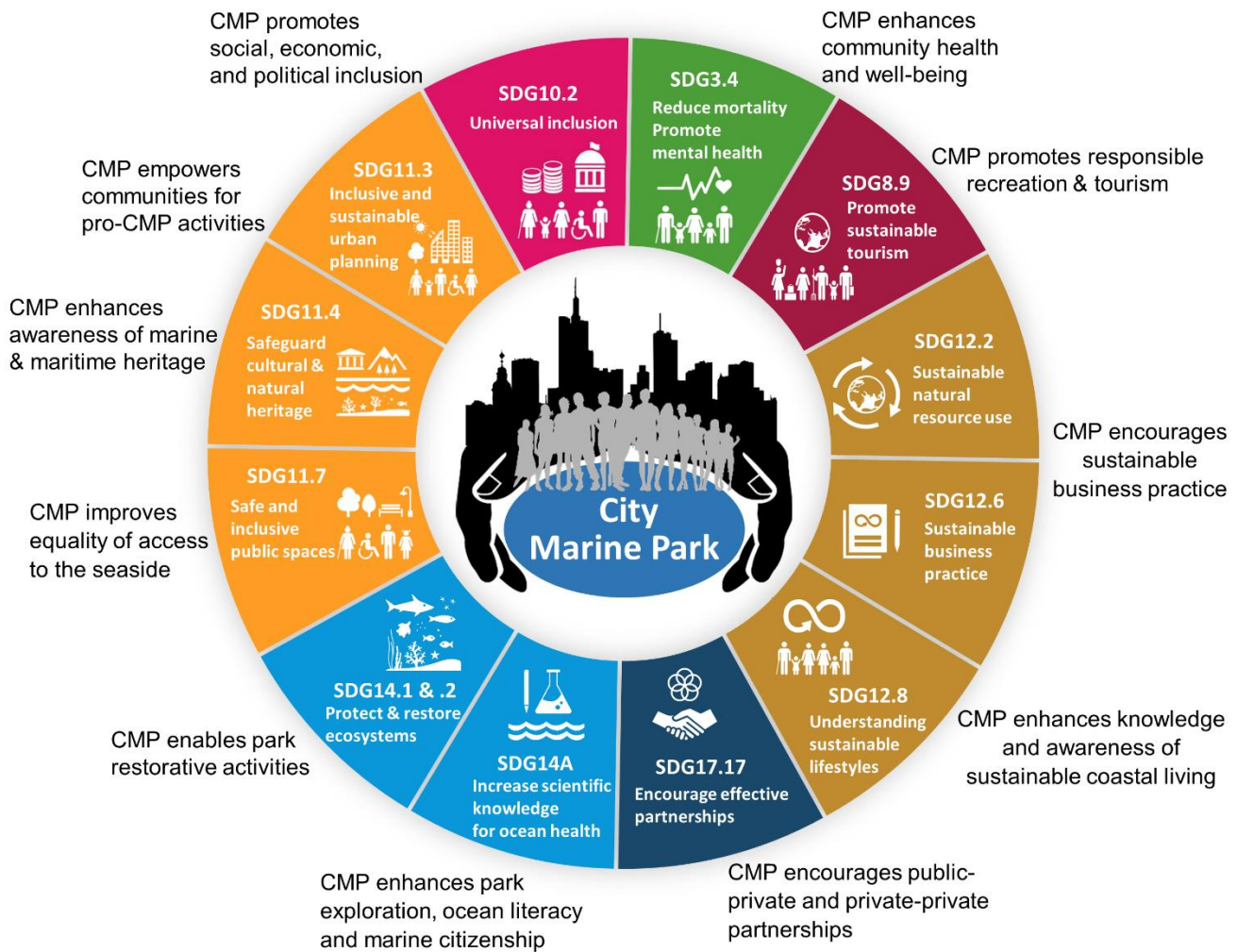
Fig. 3. City Marine Parks form a spatial nexus for addressing multiple interrelated Sustainable Development Goal (SDG) targets. Goal 3 is Good Health and Well-being; Goal 8 is Decent Work and Economic Growth; Goal 10 is Reduced Inequalities; Goal 11 is Sustainable Cities and Communities; Goal 12 is Responsible Consumption and Production; Goal 14 is Life Below Water and Goal 17 is Partnerships.

determined by the location of the park and the bio-physical, cultural and political context. The organisational structure should encourage creative and innovative entrepreneurialism and engage a city's rich social capital. Social capital acts as a catalyst for progress through the stages of the coordination process [133].