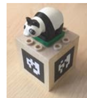
Figure 2. Object with a fiducial marker, which allows it to be identified and tracked.

Fiducial markers look similar to 2D barcodes that can be printed out or displayed on a screen for detection. Several libraries provide 6D tracking of such markers, like the chilitags library [4].