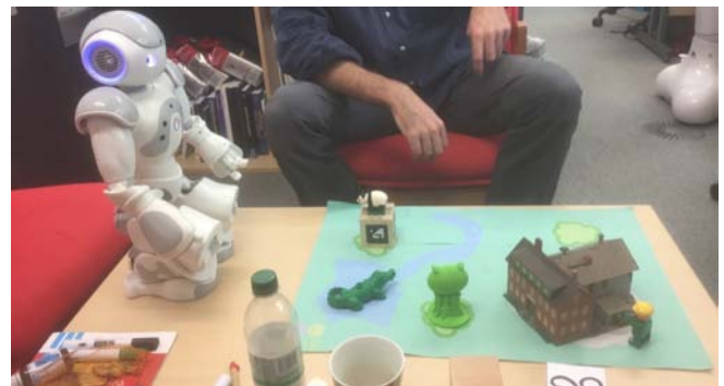
Figure 1. A close proximity interaction setup, typically found in human-robot interaction and cognitive robotics scenarios. Key scene characteristics are usually constant: relatively small objects (e.g. largest side being less than 10 cm), presence of occlusions, limited working space, and the presence of both textured and texture-less objects.

This paper tries to remedy a lack of information on deployment details in HRI contexts: many traditional assessments do not report on practical considerations. We need to take into account many different factors. For example, how robust is the detection and pose recognition when there are frequent changes to the environment, such as varying backgrounds or changing lighting conditions.