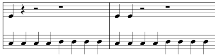
Fig. 7.8 Player builds wall to right of themselves