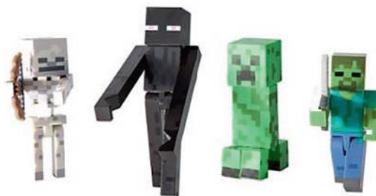
Fig. 7.15 Four of the Minecraft mobs: skeleton, enderman, creeper, zombie

Minecraft also has a variety of mobs which look and behave differently and have varying abilities. Fig. 7.15 shows four of these mobs: the skeleton, the enderman, the creeper, and the zombie. The zombie is the closest to the Musicraft mob described earlier. It simply moves towards the player and kills the player by “touching” them. In Minecraft, the skeleton fires a bow and arrow—so has a ranged attack. The enderman can pick up blocks and can teleport between locations almost instantly. If a creeper gets too close to a player it explodes a few second later, destroying an number of blocks around it.