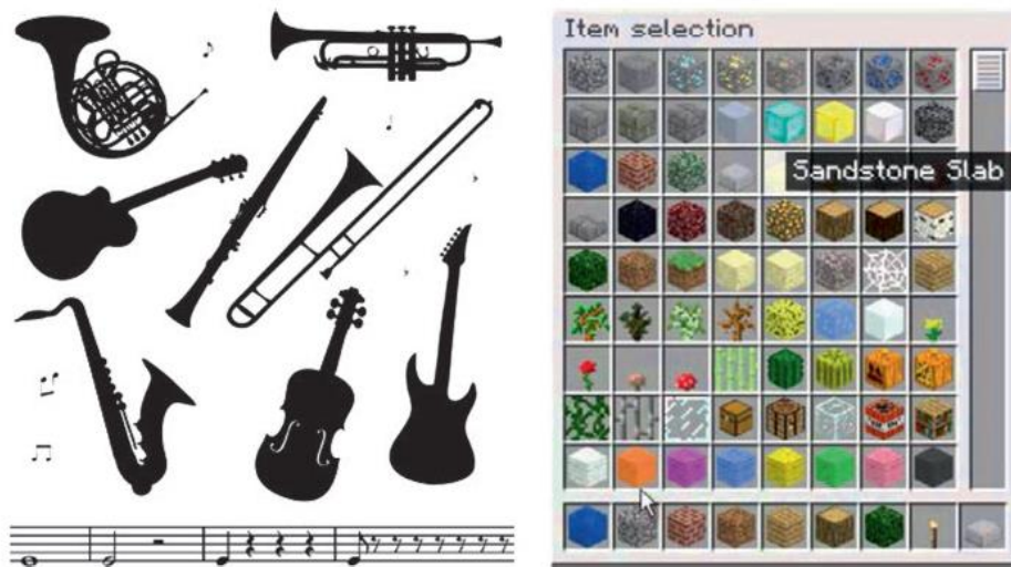
Fig. 7.14 Some Minecraft block types on the right with the sort of items that can be used to build Musicraft blocks on the left