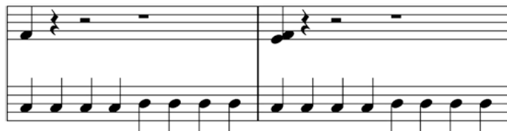
Fig. 7.9 Player jumps up one note, and builds a note under themselves