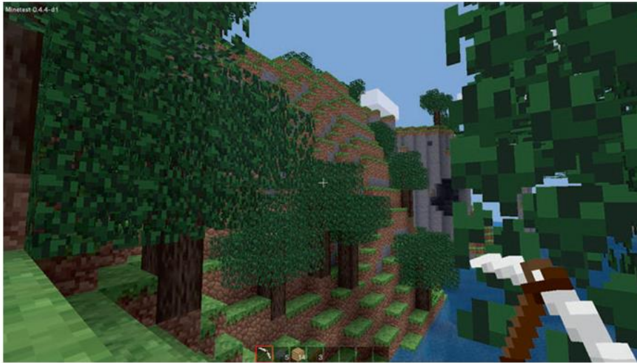
Fig. 7.1 A standard Minecraft survival environment