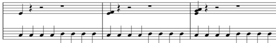
Fig. 7.11 Player double jumps up two notes and builds wall

One advantage that games which simulate a physical environment, or which simulate dance or musical playing, and which Musicraft doesn't have, is that there