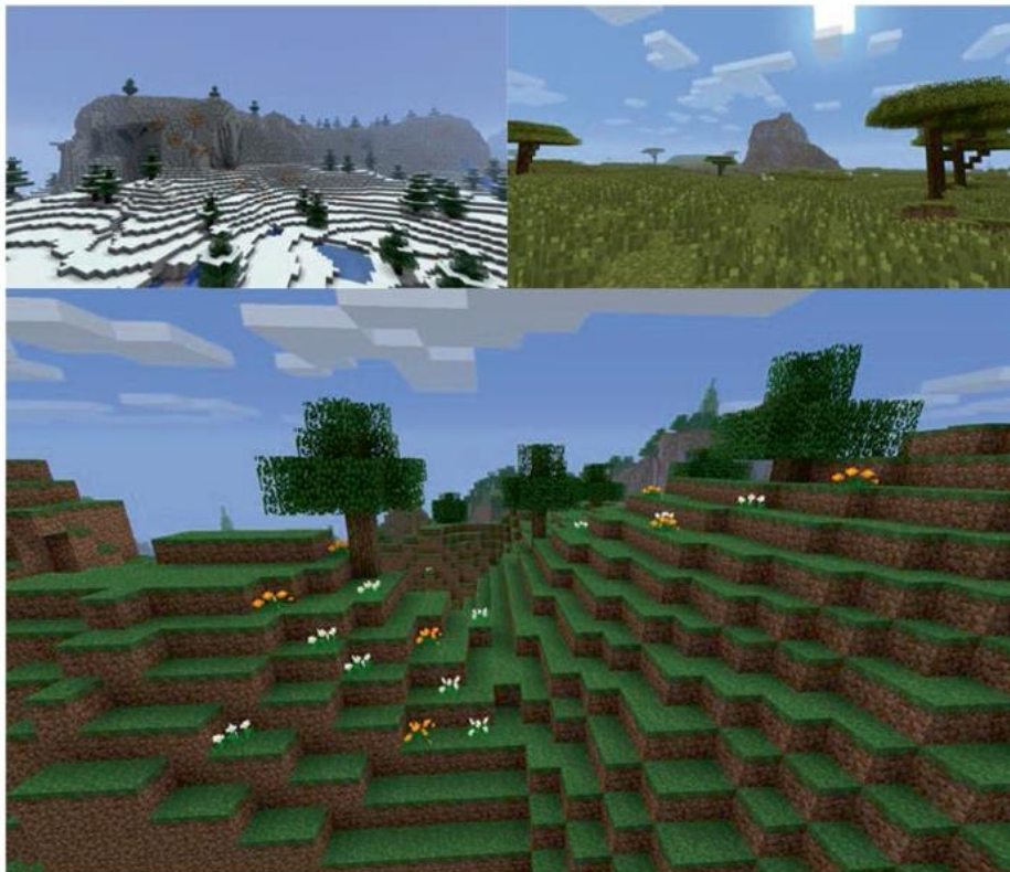
Fig. 7.19 Three Example Minecraft Biomes