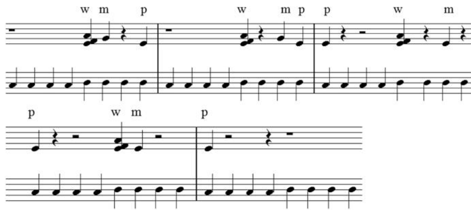
Fig. 7.18 Crawler in Musicraft, exploding and removing a wall