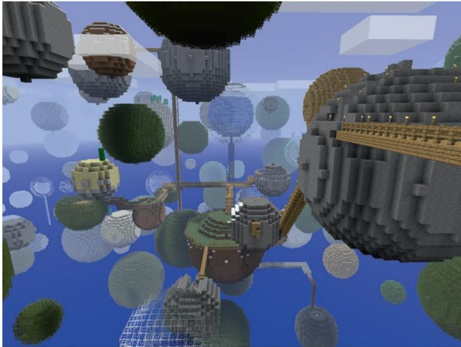
Fig. 7.2 A Minecraft environment made by a user in creative mode