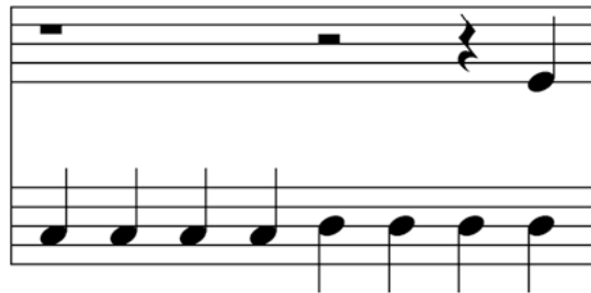
Fig. 7.6 Player moves to the left in the world