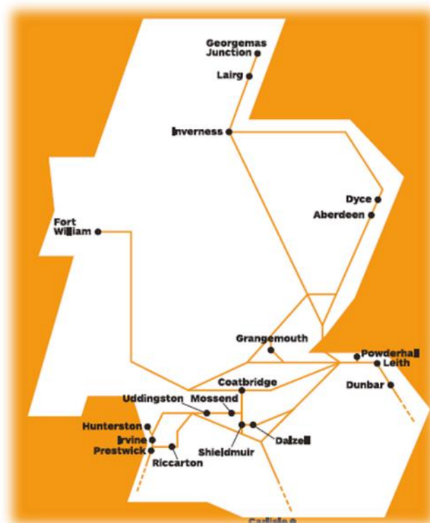
Figure 2: Scottish Intermodal Terminals

Similarly, Scotland generally displays a lack of infrastructure development as well as corresponding government initiatives which might facilitate the exploration of intermodal solutions by ports or other supply chain actors in the region (Baird et al., 2010; Monios and Wilmsmeier, 2012; Wilmsmeier et al., 2011). Baird et al. (2010) particularly emphasise that the development of intermodal transport solutions and hinterland connectivity requires an