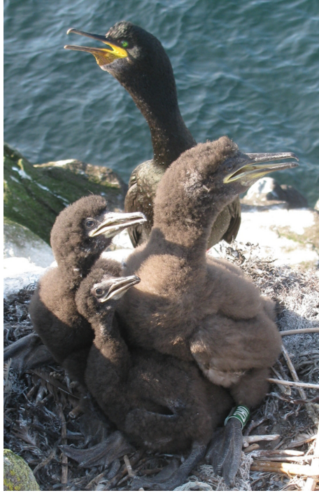
Figure 1. A brood of asynchronously hatched European shags ( Phalacrocorax aristotelis ), aged c. 25 days, with an attending parent.

investigate the effect of gastrointestinal nematode infection on individual chick growth rate and survival in a system where we can disentangle the confounding effects of parasite distributions between related individuals. We also investigate whether these differences arise as a result of changes in parental resource provisioning to the whole brood or to changes in how resources are allocated to different members of a brood.