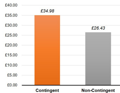
Fig. 2. Comparison of money collected in the two conditions, demonstrating a 32.2% increase for the socially contingent condition over the control.

Subjectively however, a number of members of the public who engaged with the robot reported that the robot looked “creepy” or “scary”, particularly in the contingent condition, where the robot attempted to make eye contact. This suggests that the mere addition of a human-like competence is not desirable [9], and that further refinement of behaviour is necessary to make it appropriate (e.g. the addition of suitable gaze-aversion strategies).