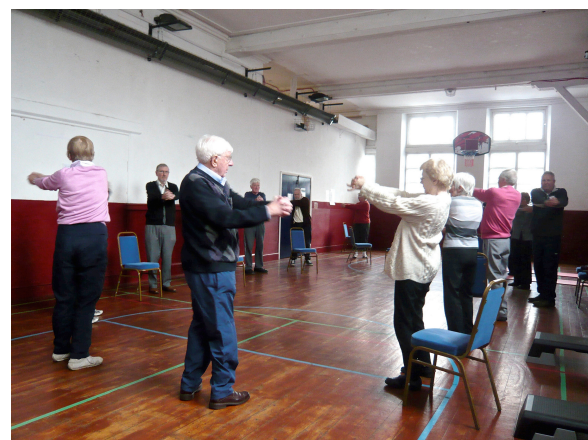
Figure 4. Posture and balance