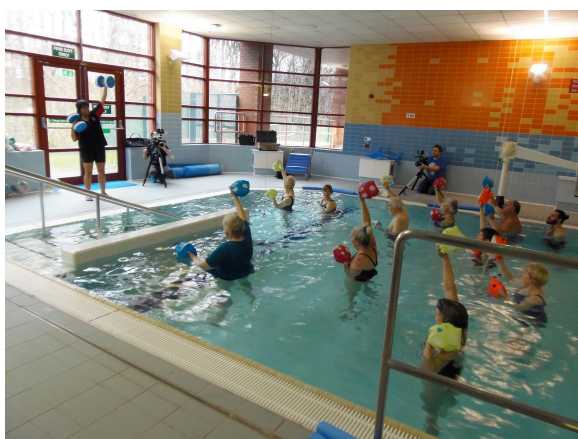
Figure 5 Aquarobics