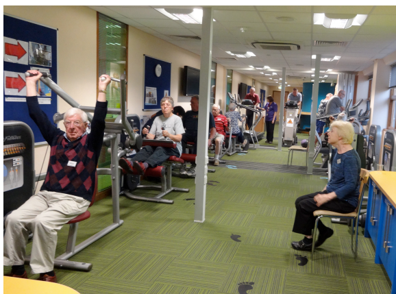
Figure 3. Circuit class