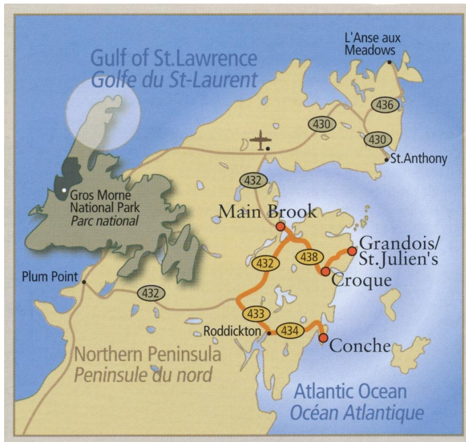
Figure 2. Map of destination site: Northern Peninsula of Newfoundland, Canada