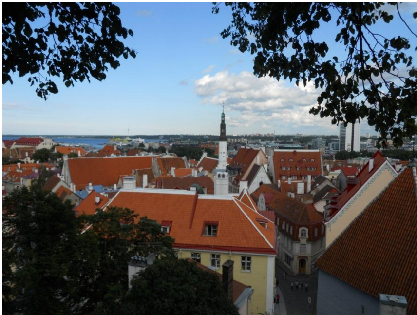
Figure 1: Old Town, Tallinn, from Toompea Hill. The university is in the middle distance.

Bravo to William Feighery for going ahead with this, the Second ETF conference, despite a disappointing number of registrations. Others loss, very much our gain. Indeed, with less than forty delegates, it is possible to secure real interaction with paper presenters – there was only one parallel session.