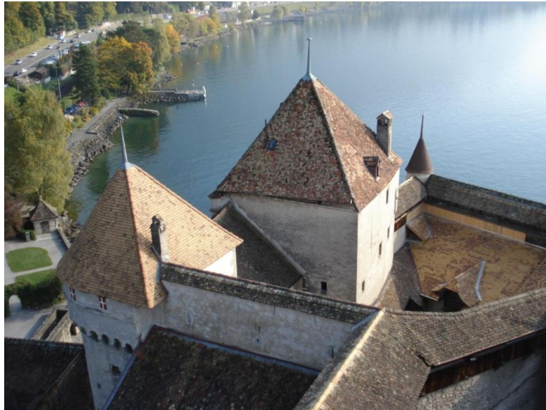
Plate Four: The view from the keep, Chillon, in October 2008