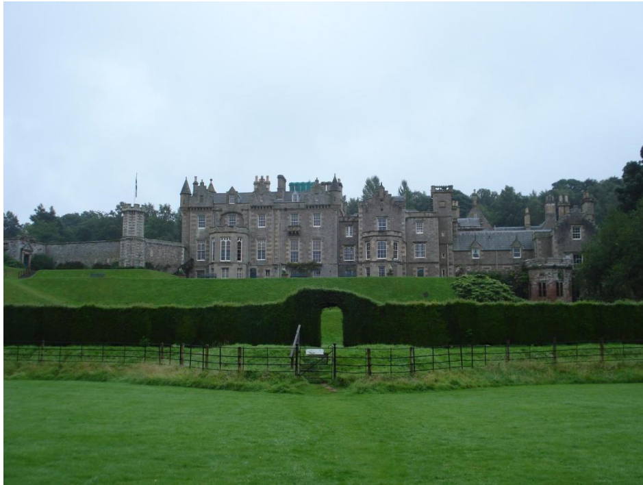
Plate Two: Abbotsford – from the River Tweed in August 2008