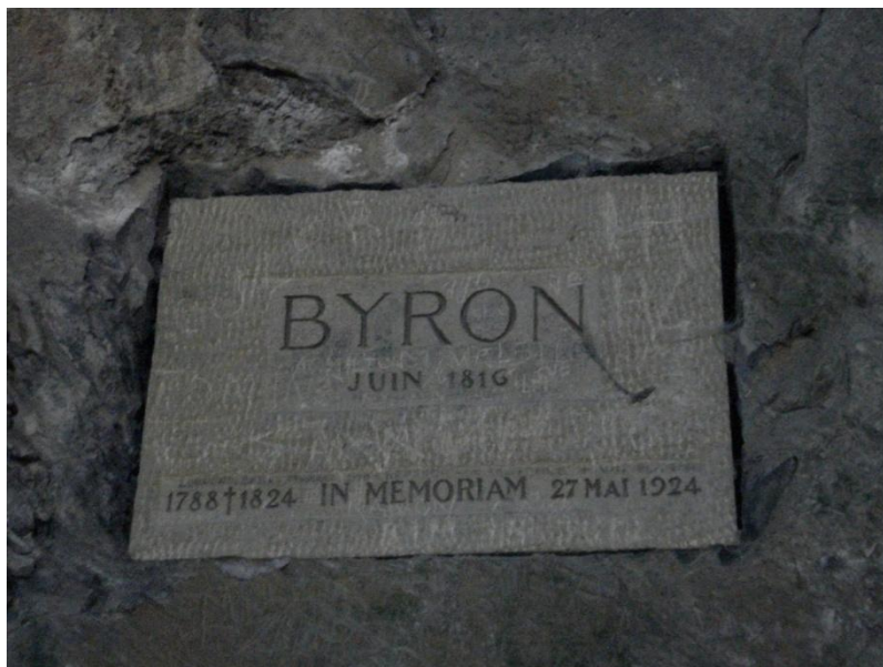
Plate Five: Byron was here...Chillon