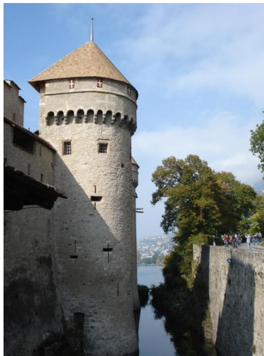
Plate Three: The castle of Chillon in October 2008