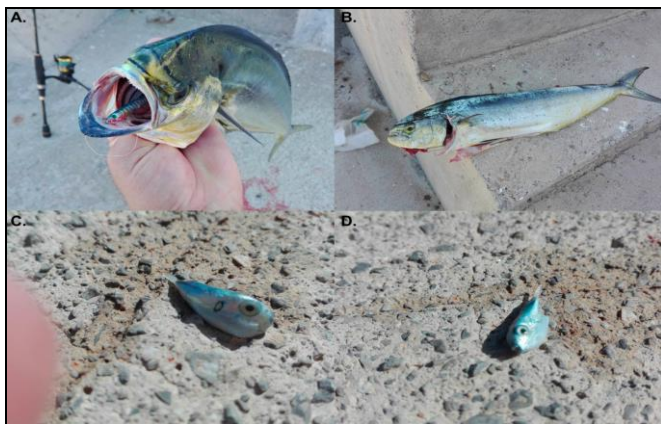
Fig 2: The specimen of C. hippurus caught (A, B) and the juvenile L. sceleratus (C, D) found in the oesophagus.

It has been demonstrated that non-toxic species show low resistance to TTX and TTX-bearing organisms use it effectively as a defensive or offensive substance [14]. According to the results of Katikou et al. (2009) [15], toxicity was not detected in any of the tested tissues of two L. sceleratus specimens smaller than 16 cm. However, the effect of L. sceleratus consumption on other species acting as predators has not been extensively studied and therefore, any assumption would be ambiguous.