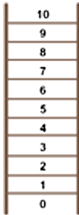
Figure 1. The mood measure.

Note: The picture of a ladder (based on Cantril's ladder) that was printed on to an A4 sheet of paper and used to measure pre-test and post-test mood.