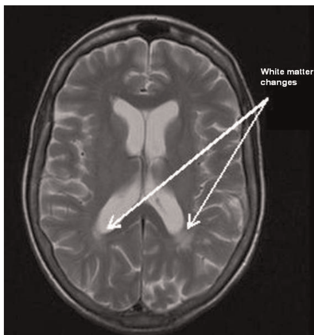
Figure 1. Magnetic Resonance Imaging showing white matter changes in the parietal area post gadolinium enhancement.

The MRI concluded that there were small amounts of non-enhancing white matter change in the parietal lobes (Figure 1 and Figure 2).