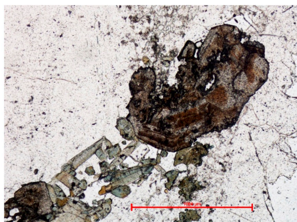
Figure 2. Cassiterite (brown) and tourmaline (blue-green) surrounded by quartz and K-feldspar in a Sn-only vein (PPL). Horizontal field of view c. 2 mm.