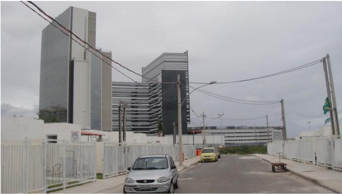
Figure 5-4. The rebuilt Vila Autódromo community—the low-rise residential properties in the foreground—with the towering Media Press Center and Hotel in the background, October 2016 (Renata Sanchez).