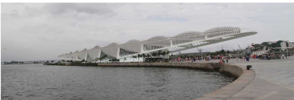
Figure 5-3. Panorama of the Museum of Tomorrow, designed by Santiago Calatrava, on the renovated harbor, October 2016.