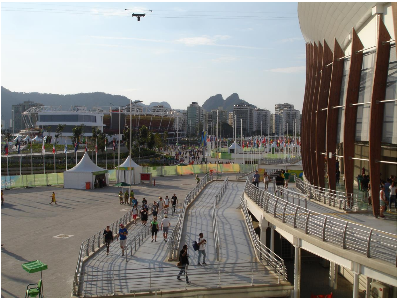
Figure 5-2. The Olympic Park during the Rio Olympic Games. The large, open spaces will need substantial investments in landscaping to integrate existing and future development areas in its legacy use, August 2016.