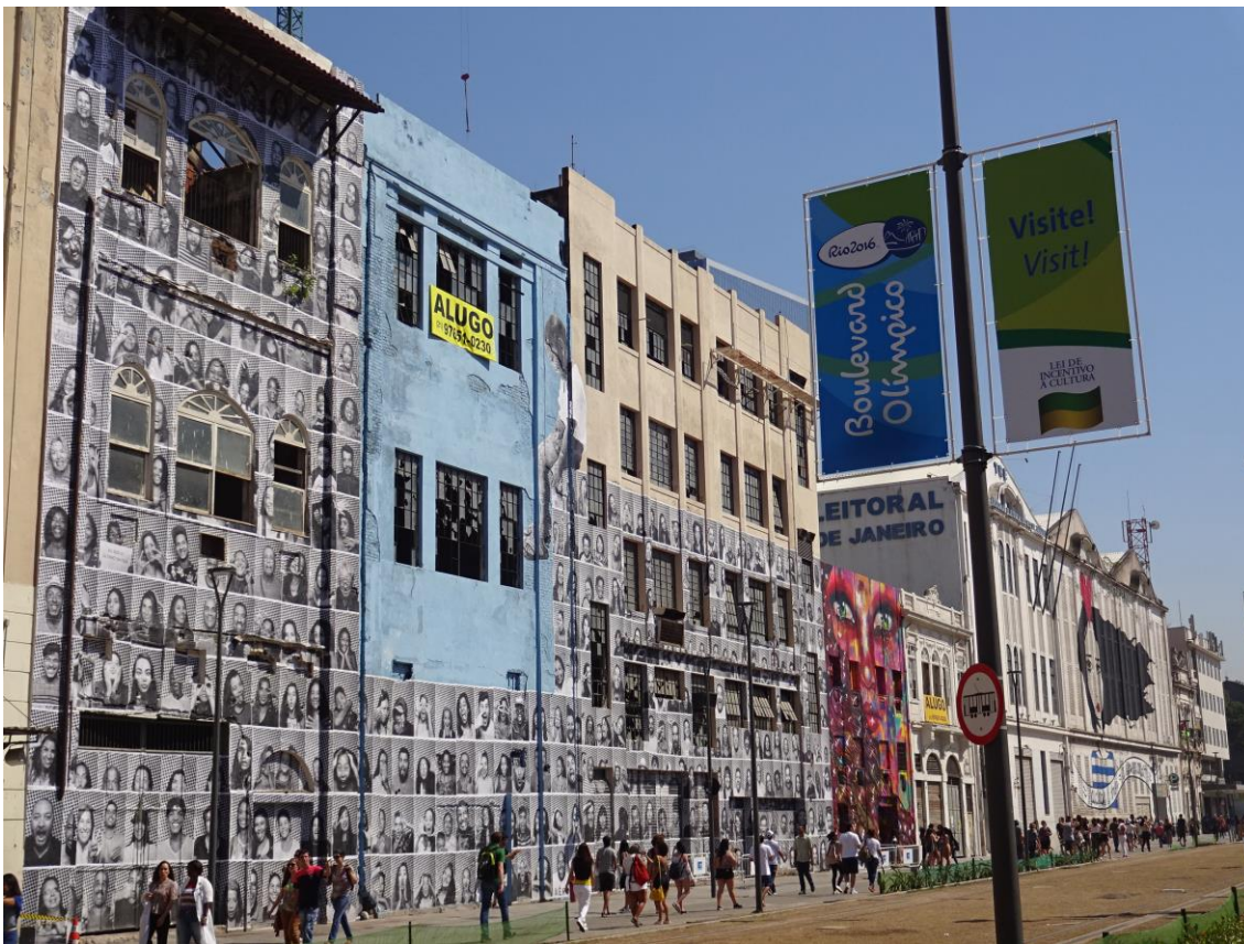
Figure 5-8. One of the artistic interventions on the façades of otherwise derelict buildings along the new harbor promenade during the Olympics in August 2016. The intention of this treatment was to create a sense of animation and vitality in what otherwise might have appeared a derelict and deprived scene and was likely to detract from a festival atmosphere (Renata Sanchez).