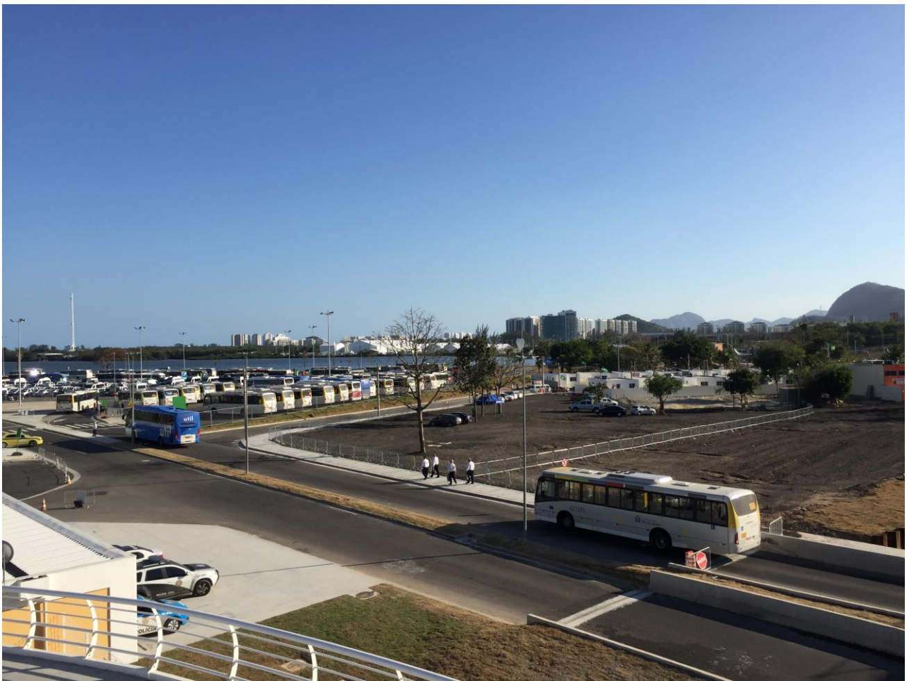
Figure 5-5. In order for the Vila Autódromo community (right middle ground) to gain some long-term coherence, the huge supporting areas needed during the Games, such as the parking lots shown here, will need to be transformed into embracing urban units that dialogue both with large-scale venues and the simpler typologies observed in the village, August 2016 (Renata Sanchez).