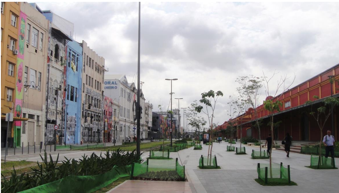
Figure 5-9. The same façades (on the left) after the Olympics in October 2016. The promenade has a good landscape architecture project but needs time for vegetation to grow (Renata Sanchez).