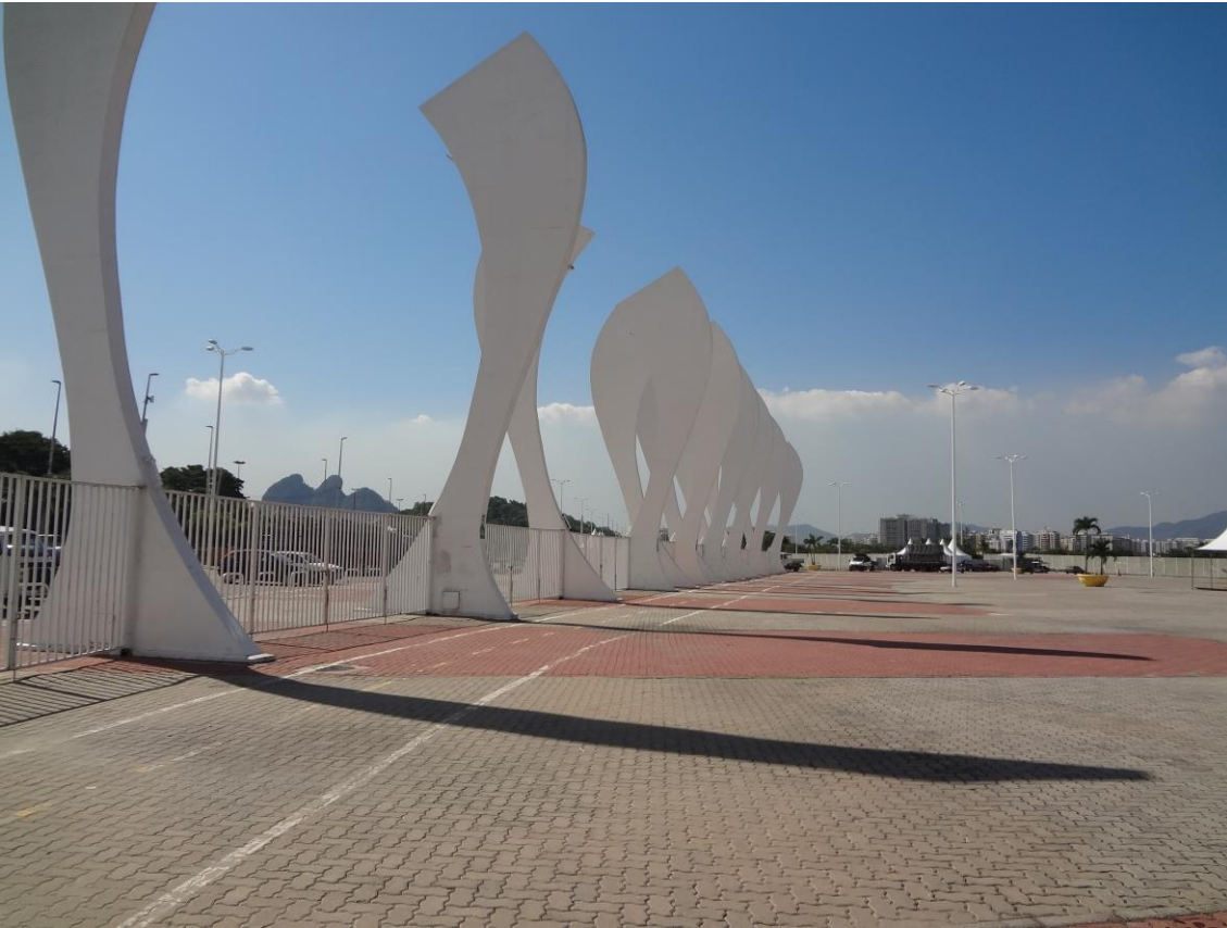
Figure 5-7. The arid athletes' park and the sculptural white elements along its entrance, May 2014.