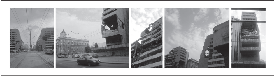
Figure 2. The Generalstab complex in (w)hole after 1999.

All maps and diagrams were done by the author.