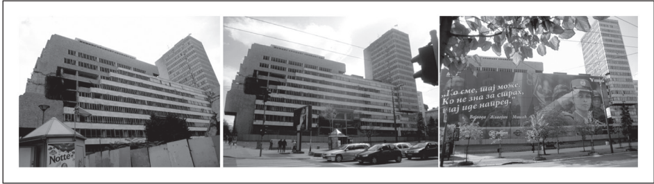
Figure 3. The Ministry of Defence – building ‘B’ in 2010, with the entry foyer removed and replaced with the billboard in 2015.

All maps and diagrams were done by the author.