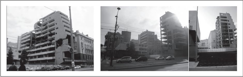
Figure 4. The Military Headquarters – building ‘A’: hollowness in 2010, and a sanitary incision in 2016.

All maps and diagrams were done by the author.