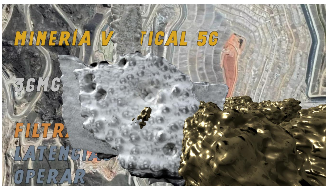
Figure 4: Violent Amalgamations, text animation, models and background. Carretera a Conga ©2020 CNES / Airbus Maxar Technologies ©2020 / Google Maps. The Underground Division, 2020

(Povinelli, 2016: 9). The complexity of the Consortium-Amalgam-Borehole produces a powerful impression of the ability to freeze life and non-life, and that ‘nowness’ is not tied to a separation of life or non-life. The intricate interplay between fullness and emptiness produces an unliveable lapse of violent quietness. While the eroding of forces and matter makes it work across time, it seems to reduce the potential levels to fight, react or re-invent to the bare minimum.