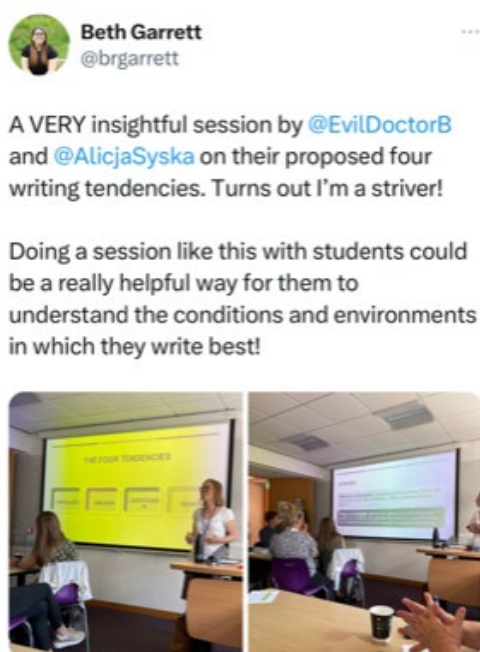
Figure 2. Tweet from Beth Garrett.

The session clearly resonated with members of the community, provoking interest and reflection, and perhaps invigorating relationships with writing.