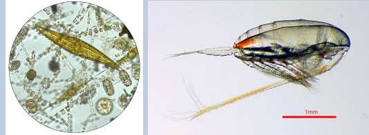
Figure 2: Plankton: phytoplankters (left) are fed on by zooplankters (right), which are food for fish

The mobile waters of the sea are the pelagic habitats , containing the mostly small drifting animals and tiny floating algae of the plankton . These habitats are part of marine ecosystems, and the benefits (such as commercially exploitable fish stocks) that these ecosystems provide to people are called ecosystem services . Economists apply the label natural capital to the components of marine ecosystems that generate these benefits.