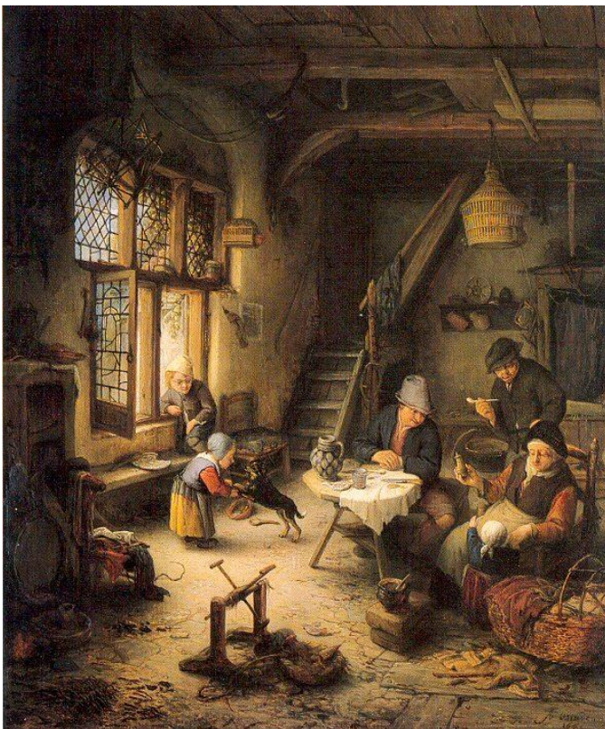
Fig. 4: Peasant Family in an Interior by Adriaen Ostade, 1661.