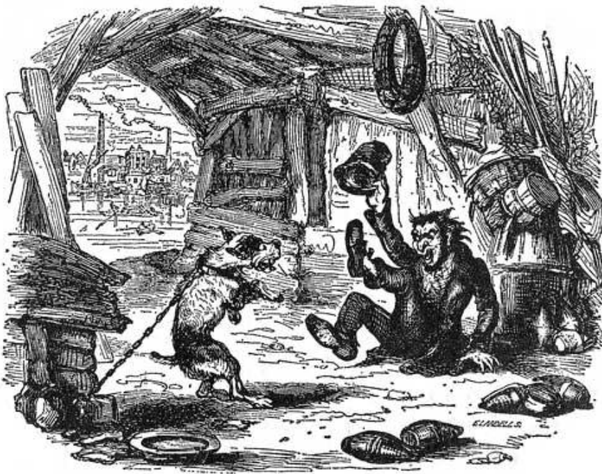
Fig. 10: Quilp Defies the Dog by Hablot K. Browne, 1841.

I turn now to Daniel Quilp from The Old Curiosity Shop , the grotesque dwarf who feeds Nell's grandfather's gambling habit, abuses his wife, and generally plots against and persecutes various characters throughout the novel. There are several very unnatural things about this character. Firstly, he seems to possess a supernatural power of knowing things which he has no means of knowing. The wanderings of Nell and her grandfather about the countryside are dictated entirely by the chance of their adventures, nobody in London has any idea where they are, and yet, their journey being pretty well advanced, the unaided Quilp manages to trace them to the town where Jarley's wax-works puts up. He even gets there first, appearing as if by magic in a niche of the old town gateway. 42 He also seems to possess an unnatural degree of physical strength. Hablot Browne's original illustrations support the narrator's descriptions of him as a miniature person, quite badly deformed, and yet he seems to be capable of acts of great violence against his wife, against Kit, and against the errand boy Tom Scott. They are all physically terrified of him.