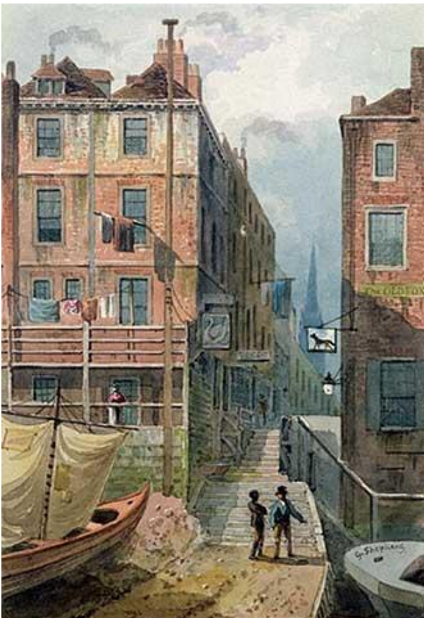
Fig. 1: Hungerford Stairs by George Shepherd, 1810.

Like several of its reincarnations, Warren’s Hungerford Stairs location was thoroughly exposed to the river, and really defined by it. The river defined the condition of its structure: by rotting its timbers with the damp, by undermining its footings to cause its ‘crazy, tumble-down’ proportions, and by sustaining the rats. Surviving images of the property also use the river to define it, by adopting a point of view on the water side at low tide, as opposed to the land side, and thereby placing the river in the foreground.