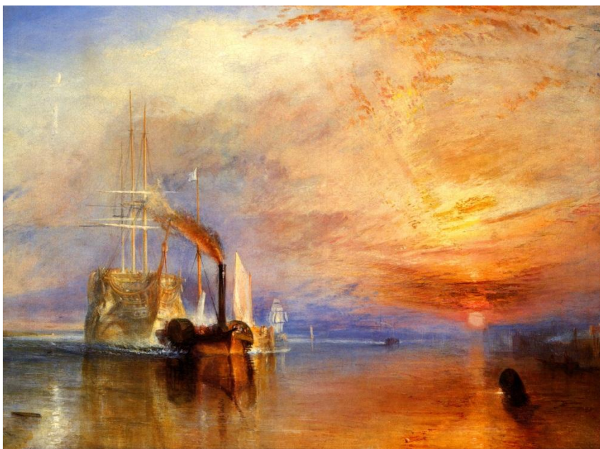
Fig. 5: The Fighting Temeraire by J.M.W. Turner, 1839.

Because of these difficulties, sail and steam technology continued to co-exist at sea for the second half of the century, before diesel engines began to take over, and there were even some ships, such as the Royal Navy’s HMS Warrior , completed in 1861, which had both sails and steam engines. 48 The Thames was a site of interface between the two technologies, where they could be seen side by side, as most famously depicted in Turner’s painting of a sailing ship being towed by steam to her last berth on the river at Rotherhithe: