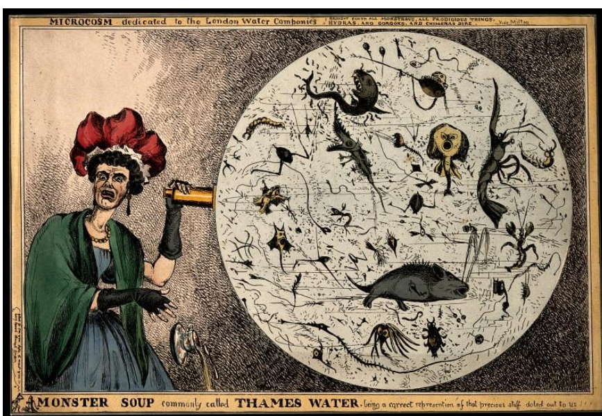
Fig. 6: Monster Soup by William Heath, 1828.

The second reason for the transformation was the problem of pollution, which beset London's river in Dickens's time like never before. Up until the early nineteenth century, most houses in London had individual cesspits which were emptied by the nightmen. According to Jonathan Schneer's account, at the turn of the nineteenth century London had 200,000 cesspits serving domestic properties alone. 8 During the first half of the century these were gradually replaced by water closets feeding into new public sewers which emptied directly into the Thames. This change was complete by 1848, when the Metropolitan and City Sewers Acts placed all citizens under a legal obligation to dispose of domestic waste in this way. 9 This led to the well-known Victorian problem of a river polluted by sewage in the heart of the capital, and to the famous 'Great Stink' of 1858. 10 The increased extent of the foreshore at the time can only have made matters worse by exposing so much more of what was euphemistically termed the 'mud'. 11 Furthermore, Schneer has suggested that the removal of old London Bridge itself also contributed to the problem by allowing increased amounts of sewage from the more polluted downstream reaches to be carried back upstream above bridge on the flood of the tide, back into the heart of the city. 12