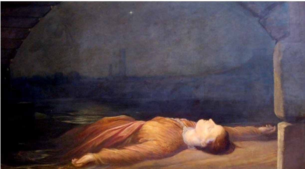
Fig. 7: Found Drowned by G.F. Watts, c.1848-50.

Meanwhile, in Watt’s image the body of the woman is dramatized by casting an artificial light upon it, and by placing and framing it within the proscenium-like arch of the bridge: